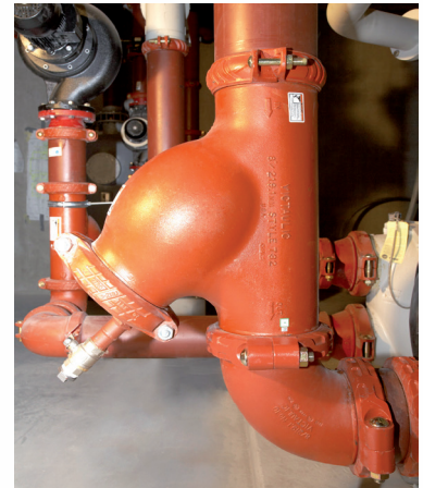
Figure 3: Access to filters and strainers is faster and easier with a mechanical grooved system

Engineers, contractors and owners all stand to gain from grooved systems. Design engineers can realize space savings; contractors can make time and cost savings to achieve on-time, on-budget hand-over to the client; owners get an efficient, reliable system which is easy to maintain. ❖