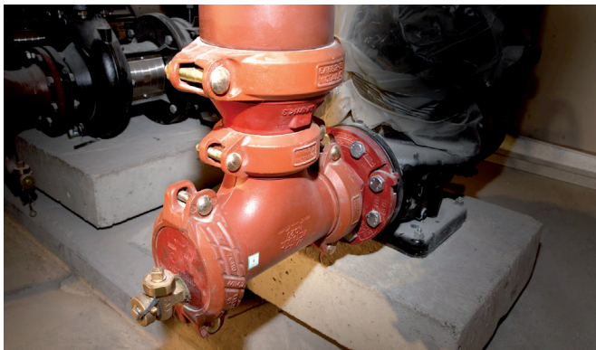
Figure 2: A suction diffuser enables pipe work to be connected closer to the pump, permitting a smaller mechanical room footprint

The grooved system lends itself to prefabrication, since pipes can be cut and grooved offsite and valves fitted to pump assemblies ready for final assembly in the field as needed.