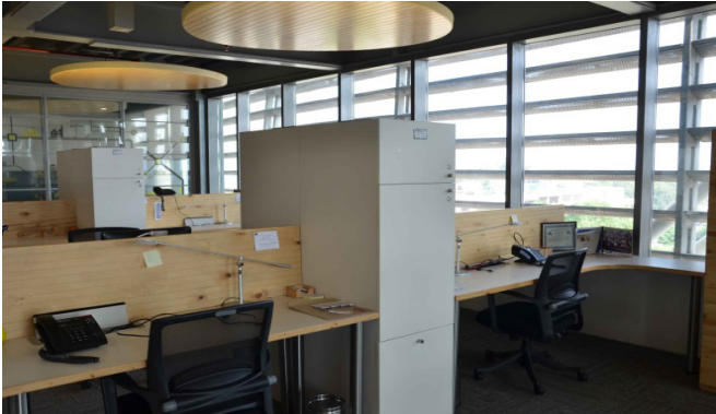
Photo 1: Actual building image with no use of artificial lighting during daytime