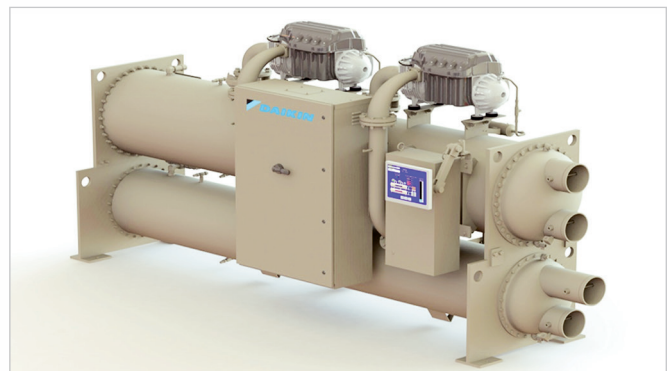
Figure 1: A Maglev chiller

W ater chillers are used in a variety of air conditioning and process cooling applications. They are used to produce chilled water that can be transported throughout a facility using pumps and pipes. This chilled water can be passed through the tubes of coils to cool the air in an air conditioning application, or it can provide cooling for a manufacturing or industrial process. Systems that employ water chillers are commonly called chilled water systems.