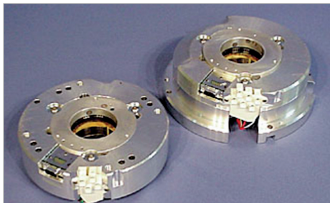
Figure 2: Magnetic bearings

Like other centrifugal compressors, the magnetic levitation technology utilizes centrifugal energy, imparted to the refrigerant gas by a rotating impeller, to increase pressure. However, unlike