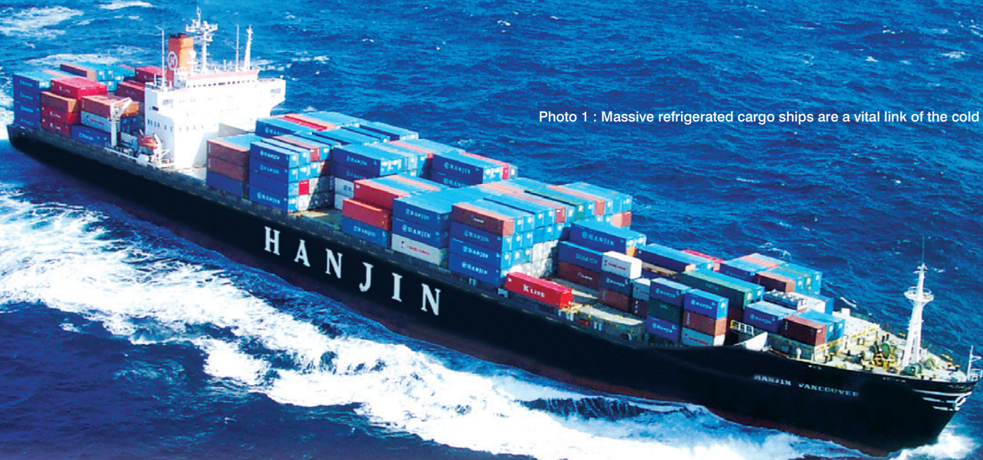
Photo 1 : Massive refrigerated cargo ships are a vital link of the cold chain