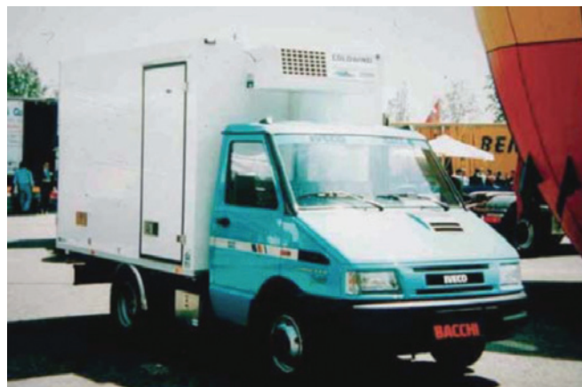
Photo 5 : Refrigerated delivery van – a standard feature in developed countries.

In developed countries there is an increasing demand for home delivery from supermarkets, especially from Internet sales where refrigerated delivery vans such as one in Photo 5 are used. There is generally a lack of suitable vehicles and operating procedures for delivery of frozen or chilled goods, resulting in home deliveries at temperatures above regulatory limits. Admittedly the temperature control is better than that in the family car which would otherwise carry the goods, but that does not detract from the supermarket responsibility to maintain temperature to the point of delivery.