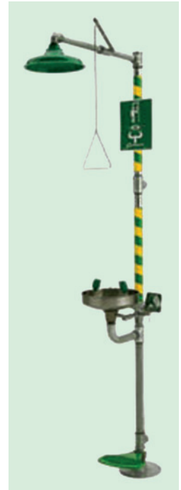
Figure 3: A shower and eye-wash facility for use in a plant room during accidental gas leaks.

Considering the various advantages in designing and operating a safe and efficient ammonia plant room, the increase or additional cost, if any, would be negligible.