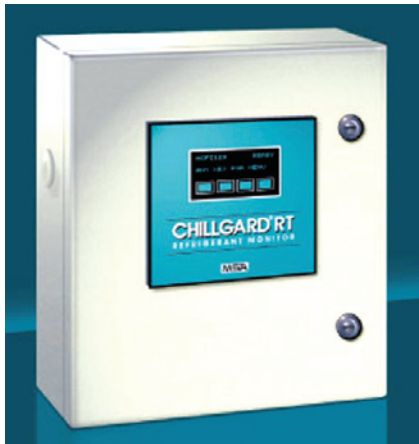
Figure 1: An ammonia-leak detector.

A typical ammonia plant room with a good ventilation system will still contain about 5-6 ppm of ammonia. It is therefore necessary to have an effective leak detection and ammonia ventilation system in the plant room.