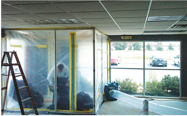
Photo 7: Insulation removal following hazardous material procedure.

ventilation. Insulation is removed over a portable hood and underlying surfaces are covered with plastic sheeting. The ventilation unit consists of an inverted exhaust hood atop an aluminum portable rolling containment, with a HEPA-filtered exhaust system. Height of the hood is adjustable and it is set just below the piping (Photo 8).