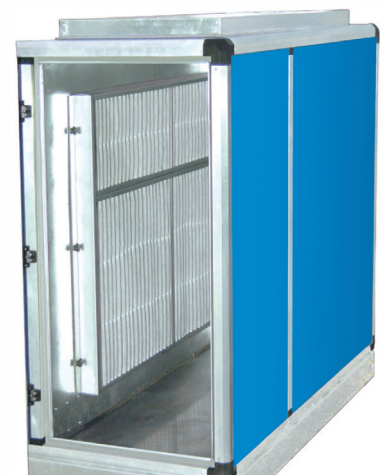
Figure 5: Mixing section

In order to maintain indoor air quality, AHUs commonly have provision to allow the introduction of outside air into, and the exhausting of air from, the building. In temperate climates, mixing the right amount of cooler outside air with warmer return air