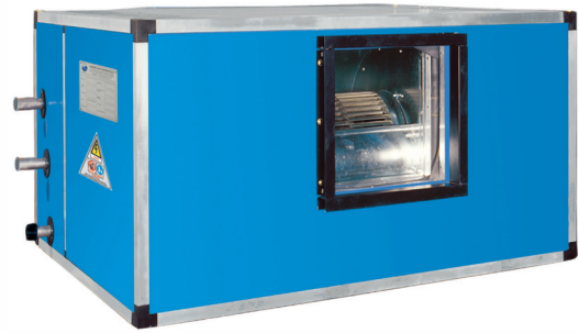
Figure 3: Ceiling suspended AHU

assembled on-site. Modular units generally allow high flexibility and can meet most air processing requirements.