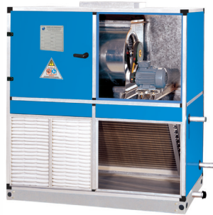
Figure 2: Vertical floor mounted AHU