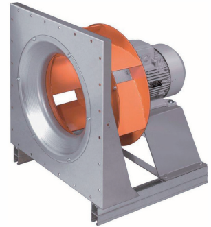
Figure 8: Plug fan

SISW (single inlet single width): with backward or forward curved impellers.