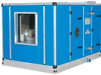
Figure 1: Horizontal floor mounted AHU