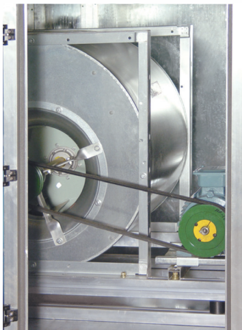
Figure 9: Fan and motor module

Drivers are sized for a minimum of 150% driven horse power. The motor should be permanently lubricated, having sealed ball bearings to provide trouble-free operation with minimal maintenance. Shaft and belt guard should be provided to avoid accidents.