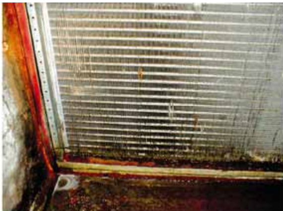
A typical dirty cooling coil