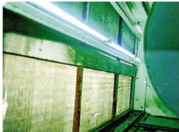
A typical clean coil after installation of UVC lamps.