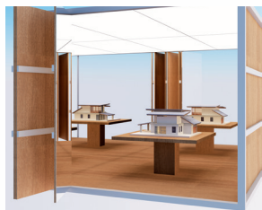
Figure 2: The mirror box

CARBSE also has a range of energy and indoor environment audit systems, which are used in monitoring the performance of existing buildings. Each tool measures aspects of temperature and humidity, air velocity, and light, and some measure multiple criteria. Its micro weather station, with a four-sensor data logger, uses a network of smart sensors to take measurements, which helps in multi-channel monitoring of micro-climates. The micro-sensors measure temperature, RH, rain, wind speed and direction, soil moisture, solar radiation and photosynthetic active radiation;