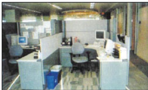
Figure 2 : Open plan office with one floor diffuser per workstation