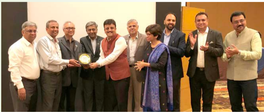
Aurangabad wins the Best Sub-chapter award