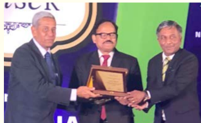
Voltas receives Employer Recognition Award

Employer Recognition Awards, which were also conferred during the Curtain Raiser, were bagged by Voltas Ltd., Mumbai and KNND Associates, Bangalore.