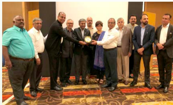
Coimbatore gets the award for financial compliance