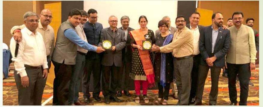
Pune and Thane share the Best Chapter award in Category 2

Mumbai Chapter won the overall Best Chapter Award for Category 1 (over 750 members). Pune and Thane shared the Best Chapter Award for Category 2 (250 to 750 members), while Vadodara was the winner in Category 3 (less than 250 members). Aurangabad and Guwahati were the Best and Runner-up Sub-chapter respectively.