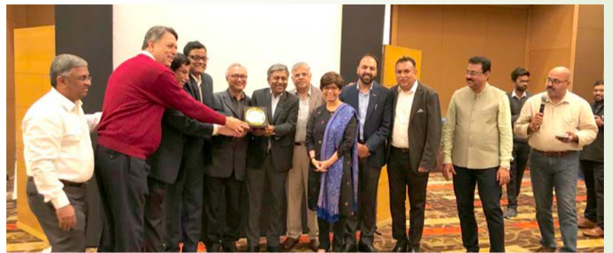
Guwahati is the Runner-up Sub-chapter

Special awards were given to Deccan (for organization), Coimbatore (for financial compliance), Delhi (for education) and Chandigarh (for multiple activities).