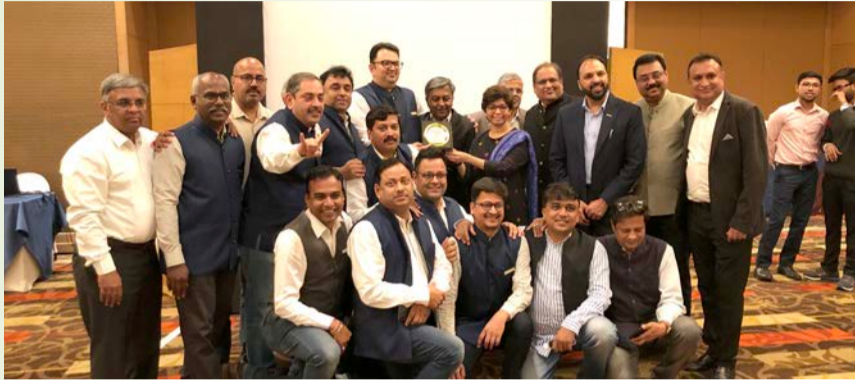
The jubilant Mumbai Chapter team receives the Best Chapter plaque in Category 1