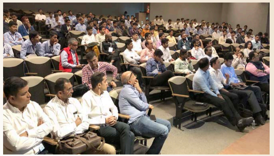
A view of the packed auditorium