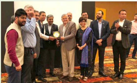
Deccan is recognised for organization

Special awards were given to Deccan (for organization), Coimbatore (for financial compliance), Delhi (for education) and Chandigarh (for multiple activities).