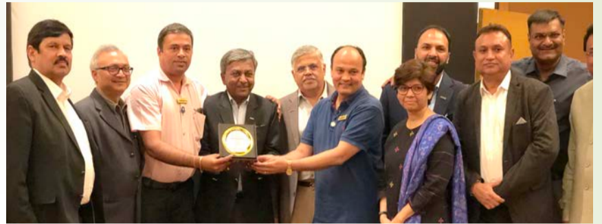
Vadodara is the Best Chapter in Category 3