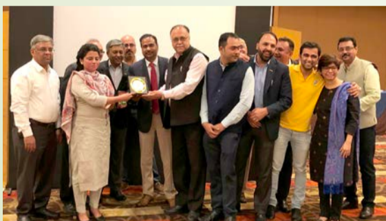
Delhi is recognised for education