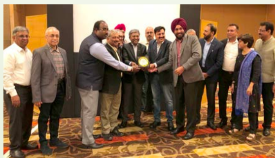
Chandigarh is awarded for multiple activities